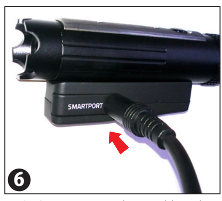
Option 1> Connect the AV cable to the Smartport.

There are two options for connecting the Smartport with your device: 1) AV Cable 2) Bluetooth Accessory