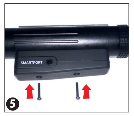
Use the two screws to secure the Smartport in place.

There are two options for connecting the Smartport with your device: 1) AV Cable 2) Bluetooth Accessory