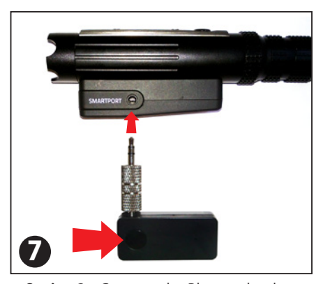
<Option 2> Connect the Bluetooth adapter to the Smartport and switch it on.

Connect the other end of the AV cable to the headphone jack of your smartphone device then run the EVO laser app.