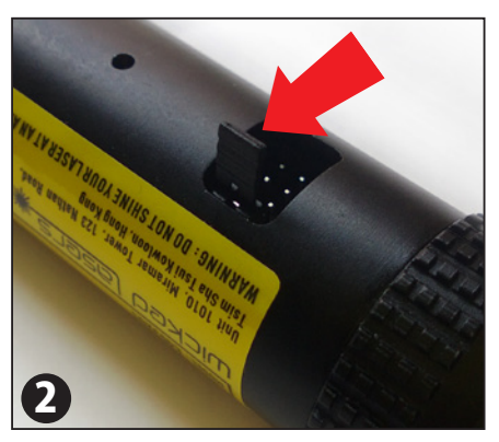
Remove the jumper shown here before connecting the Smartport.

Remove the bottom metal panel to access the connection area for the Smartport.