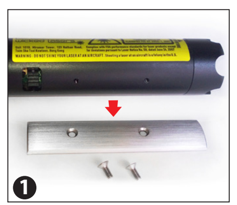
Please visit http://www.wickedlasers.com/evo to download the app for your smartphone.

Remove the bottom metal panel to access the connection area for the Smartport.