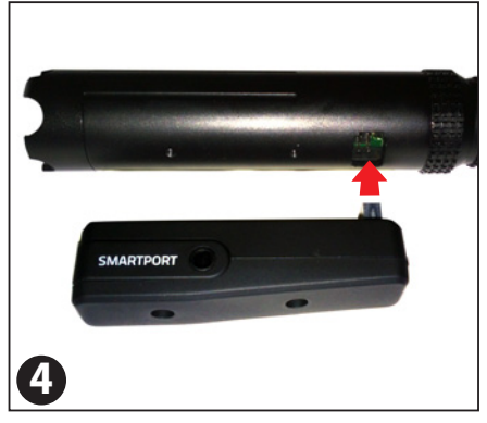
Connect the Smartport to the laser module section.