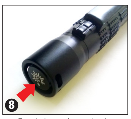
Turn the laser on by pressing the the button on the tail cap.

Pair the Bluetooth adapter with your smartphone device then run the EVO laser app.