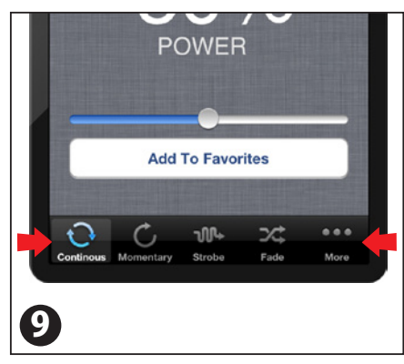
The laser will start in Continuous Mode by default. You may select other operating modes from the menu bar.

The main operating modes are Continuous, Momentary, Strobe and Fade.